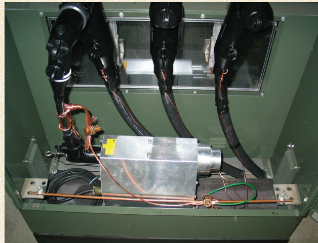
Charging transformer installed in a padmount switch.